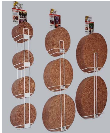
D-WSA-CP-48 D-WSB-CP-36 D-WSC-CP-36